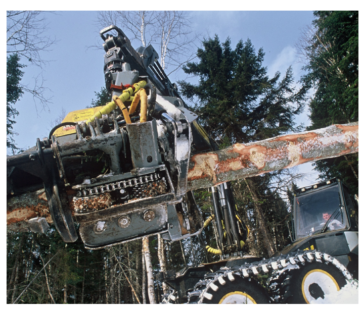
Photograph from "The Forests of Canada" collection, Natural Resources Canada, Canadian Forest Services, 2003

Since third-party sustainable forest management (SFM) certification programs were introduced in Canada in the mid-1990s, certification—which complements Canada's already stringent laws and regulations regarding forest management—has become a widely respected means of demonstrating that Canadian forest companies meet the highest standards of sustainable forest management.