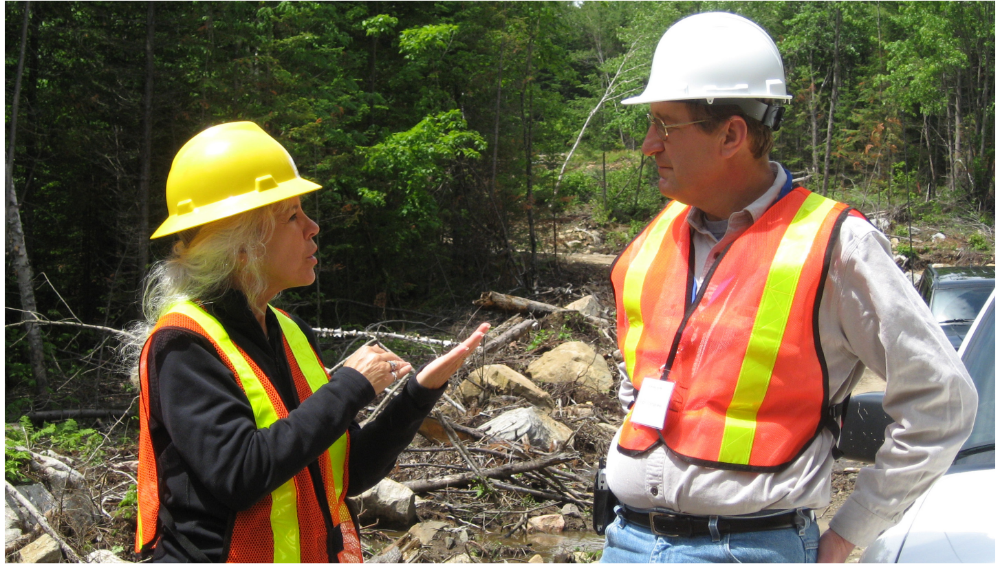
Photograph from "The Forests of Canada" collection, Natural Resources Canada, Canadian Forest Service, 2003.