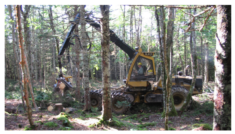
A "single-grip" harvester equipped with eco-tracks that limit damage to the forest floor selectively removes trees in a forest. Thinning the forest permits more light to penetrate the stand, encouraging faster regeneration of "climax" species such as white pine, red spruce, and yellow birch.

To earn and maintain certification for the forest lands they manage, companies must meet legal requirements; develop and implement sustainable management practices;